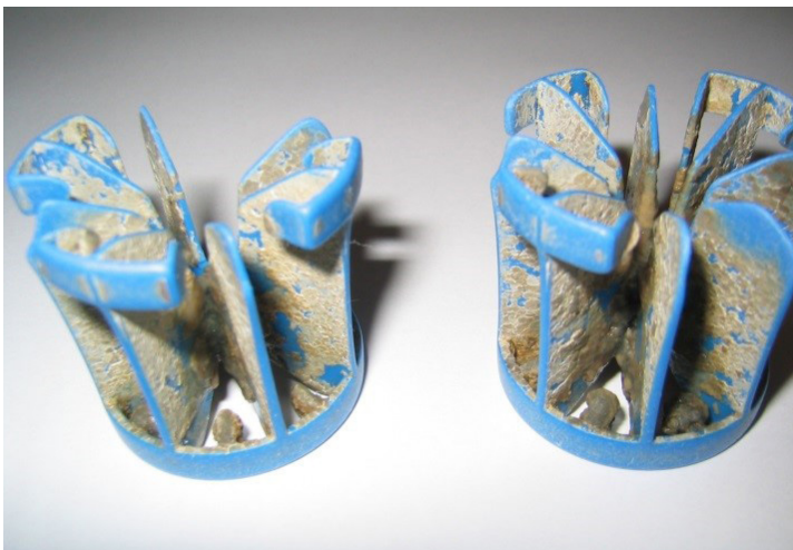
Tubular carrier types.