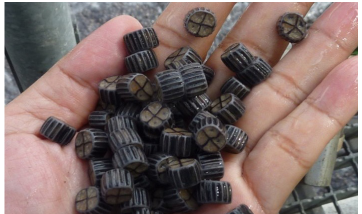
Clogged tube-shaped carrier.