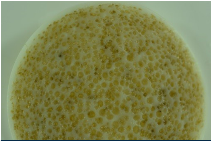
Unclogged Mutag BioChip™. Biofilm is only inside pores