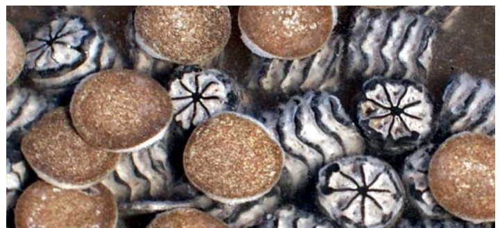
Clogged conventional carriers and unclogged Mutag BioChip™.

In contrast, clogged carrier elements are characterized by thick biofilms that hinder the supply of substrate, nutrients, and oxygen to the deeper biofilm layers. Consequently, these deeper layers are either minimally or not biologically active at all and furthermore, the thick biofilms reduce the available surface area for the attachment of active microorganisms, leading to a decrease in biodegradation capacity.