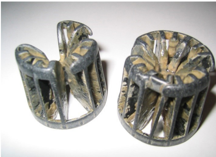
Abrasion of carrier media in operation.