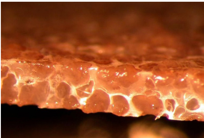
Pore system of the Mutag BioChip™, ensuring durably thin biofilms for optimal diffusion of substrate, oxygen and nutrients into all layers. Any biomass expanding out of the pores is permanently removed by shear forces.

The removal performance stays consistently high, all thanks to the naturally regulated thin biofilms on the Mutag BioChip™, as previously explained, which are maintained at this optimal thickness through the self-cleaning action of shear forces. This means there is no decline in performance due to the formation of thick biofilms, as often seen with conventional tubular carriers. This stability in the biological treatment process is of paramount significance, particularly for end-customers and regulatory authorities, as it guarantees the consistent attainment of the necessary effluent parameters without any exceptions.