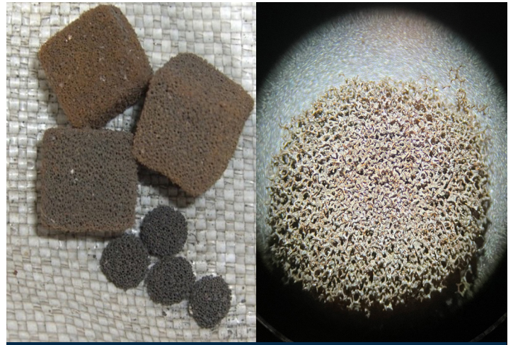
Foam carriers before and after operation - abraded.

Each element of the Mutag BioChip™ media possesses a remarkably low mass relative to its size. Consequently, when these elements interact with one another, the force transferred is so minimal that it effectively reduces the possibility of abrasion and wear to a minimum.